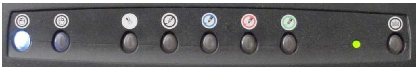
L / R Click